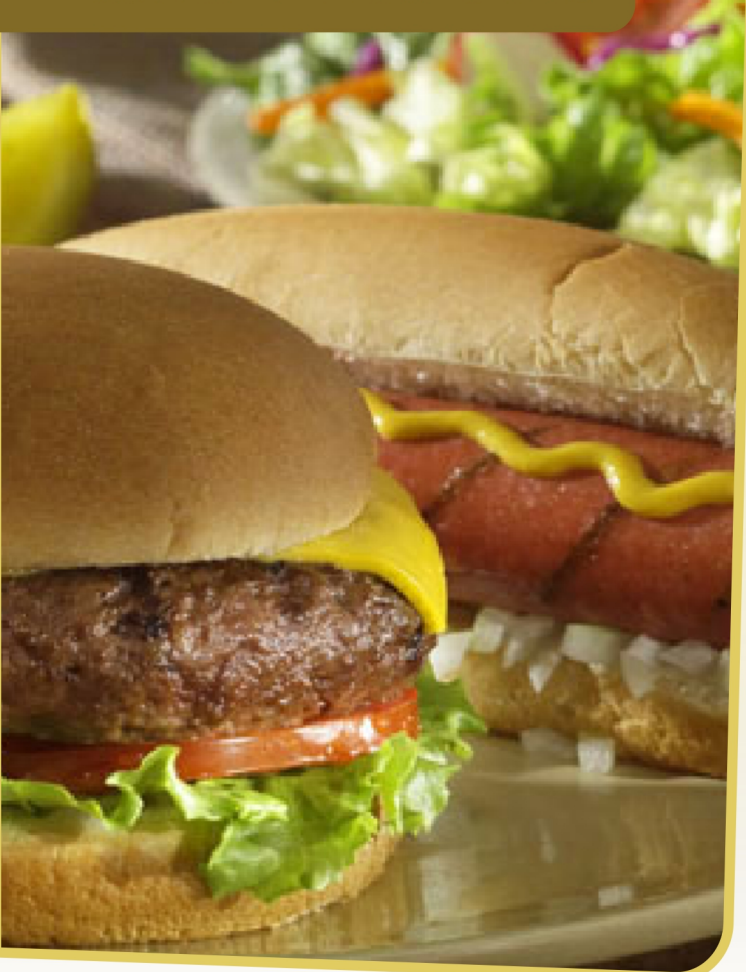
Prices may change without notice Plus applicable taxes