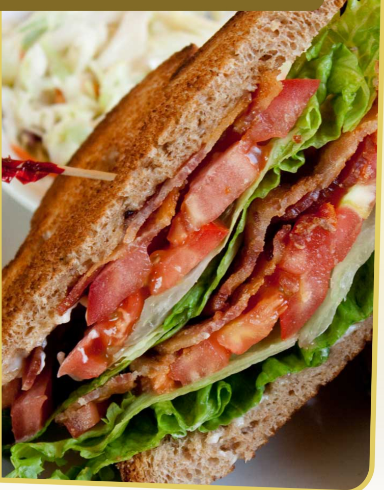
Prices may change without notice Plus applicable taxes